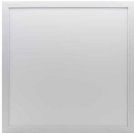
5 Year Limited