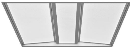
0-10v 1% Optional