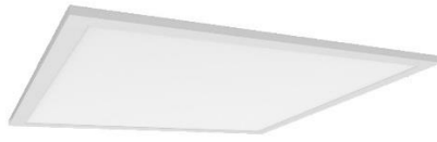
0-10v 100% to 10%