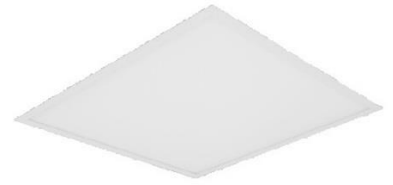
0-10v 100% to 10%